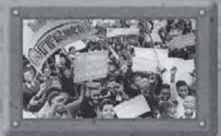
Students marching in Soweto on 16 June 1976.