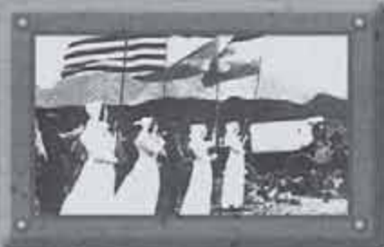
The Great Trek Centenary celebrations in 1938 took place at the future site of the Voortrekker Monument in Pretoria.