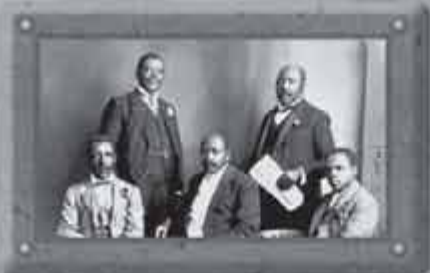
A delegation of the SANNC who went to London to protest against the Land Act of 1913.