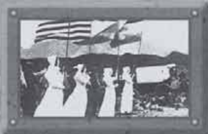
The Great Trek Centenary celebrations in 1938 took place at the future site of the Voortrekker Monument in Pretoria.